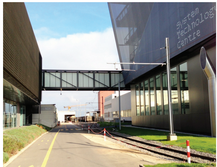
Nestle System Technology Centre | Orbe, Vaud, Switzerland Concept Consult Architectes